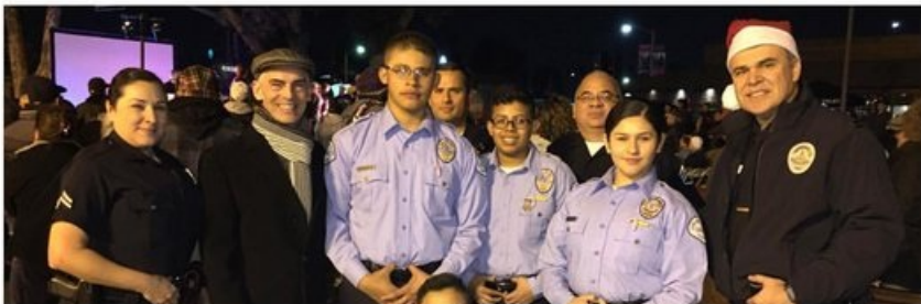
Echo Park Community Parade